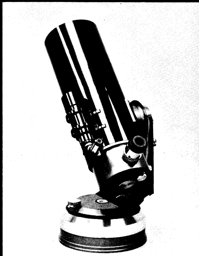
THE QUANTUM SIX

Portable Pedestal and Wedge Assembly, latitude adjustment 12° to 58° ..... $310.00