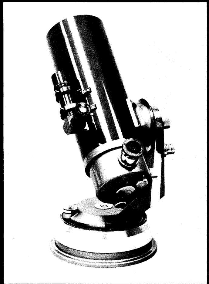
THE QUANTUM FOUR

Davis & Sanford Model B with Rising Center Post and MH-3 Pan Head with Quantum Adapter. . . . $195.00 Photo-Barlow Lens, 2x .....$40.00 Solar Filter, Full Aperture .....$135.00