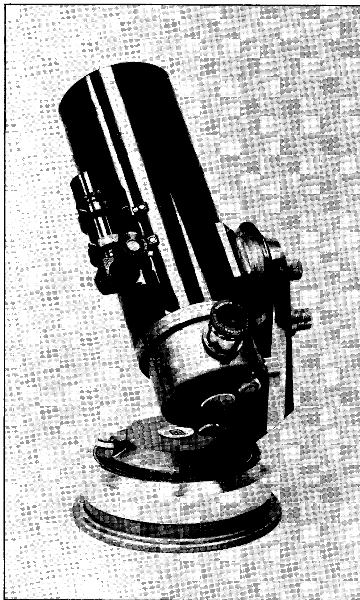
QUANTUM FOUR at $895.00

Every Quantum telescope which leaves our hands will show a stellar diffraction pattern similar to the one shown above. Each will equal the resolution and contrast limits that theory prescribes for it. Why? Because every O.T.I. telescope is manufactured to the highest standards of optical quality. It's simple: quality performance requires quality optics.